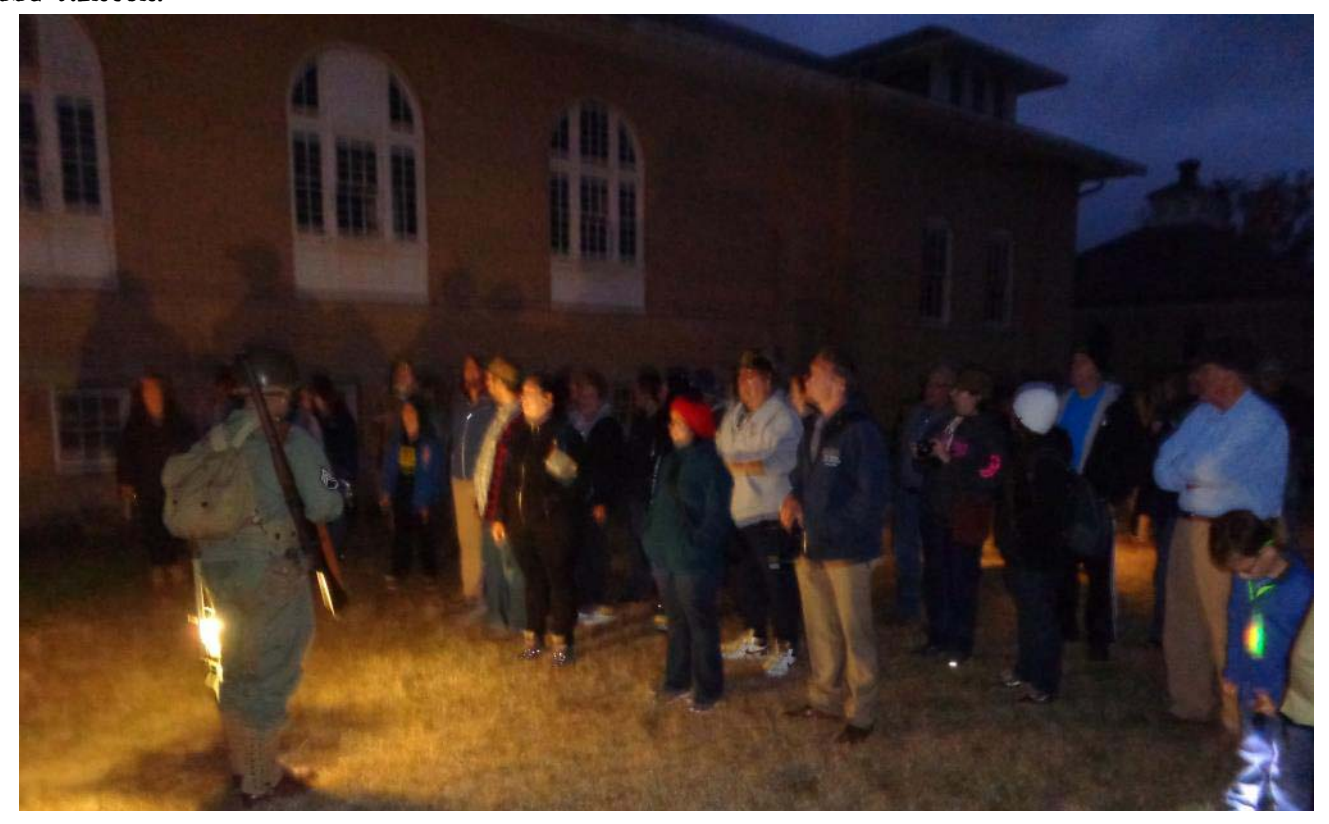
In the photo below, our visitors and the team move into the southern emplacement of the former Mortar Battery. This was one of four such emplacements in the Battery.