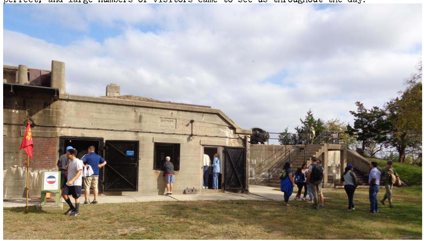
Below a large group of Cub Scouts prepares to visit the gun platform.

The photo below provides an overview of the battery display. The weather was perfect, and large numbers of visitors came to see us throughout the day.