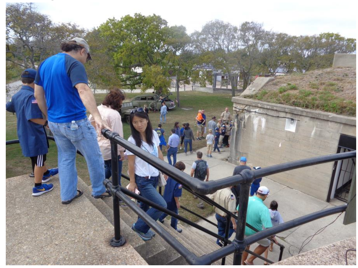
Upon entering the magazine, they were greeted by SSG Weaver for the Ammunition tour.

After the picture, the visitors descended the stairs and headed to join SSG Weaver in the magazines.