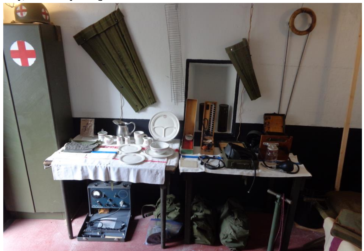
The historic photo seen here, posed next to a Medic's helmet, is of the Station Hospital at Fort Hancock, built in 1896. Sadly, this building was destroyed by fire in 1985.

The vintage medical items, which include US Army Medical Department mess hall crockery, are always of great interest to our visitors.