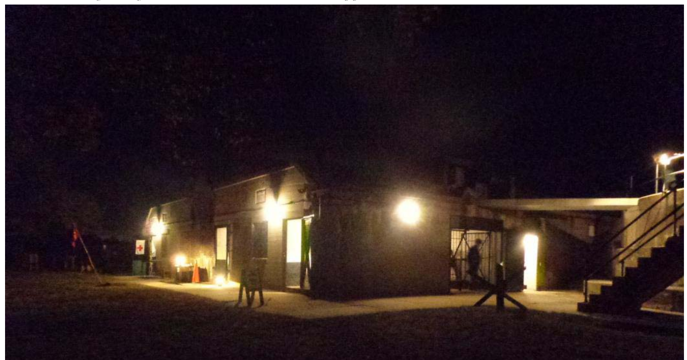
The picture below clearly shows the Gun #1 platform lights, the opening to the magazine and the smaller door into the telephone cabling booth.

The scene below greeted each tour group upon arrival at Battery Gunnison/New Peck. The Battery now looks much as it did during 1943, lit at night with both original and exterior lighting. The platform lights are historic, the rest of the exterior lighting is modern but close in appearance.